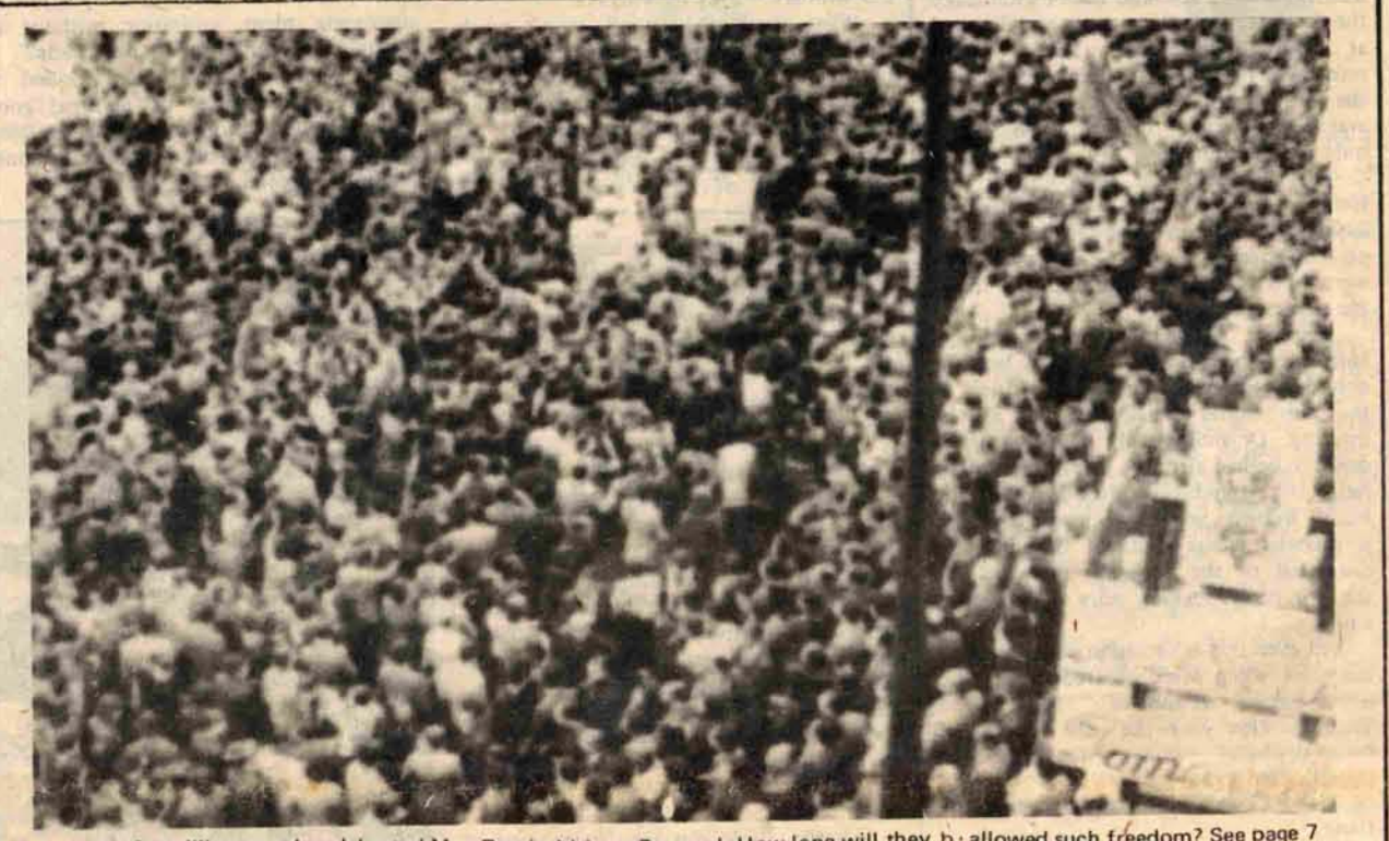
Quarter of a million people celebrated May Day in Lisbon, Portugal. How long will they be allowed such freedom? See page 7

The Sunningdale agreement is due to be ratified soon. It makes it necessary that the republicans should be cut off from their base and no longer operate with the comparative freedom of some time ago.