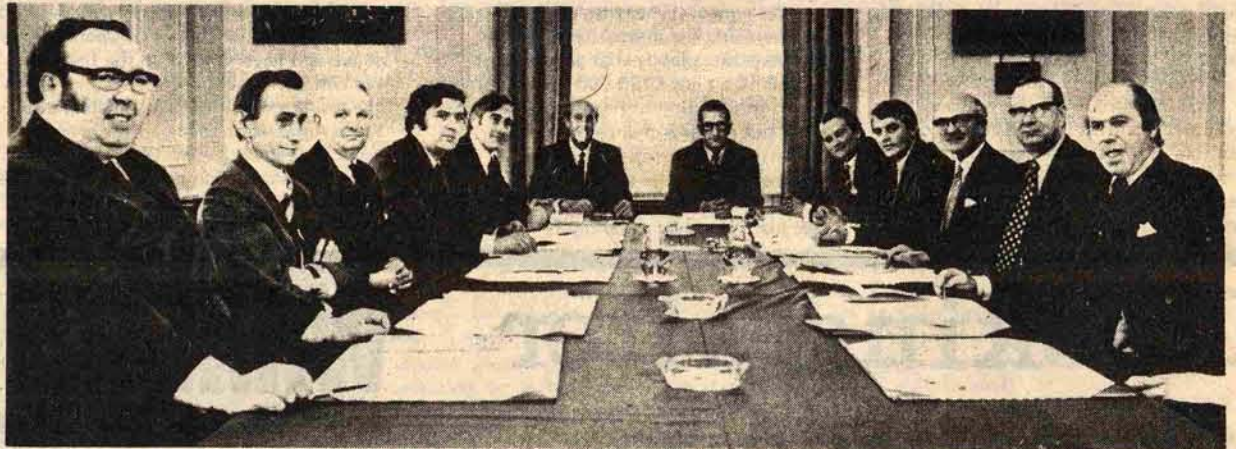
Smug looks on the faces of the Executive

Take British Enkalon, for example. At the end of March the Chairman of the company announced an increase in profits from half a million pounds to almost three