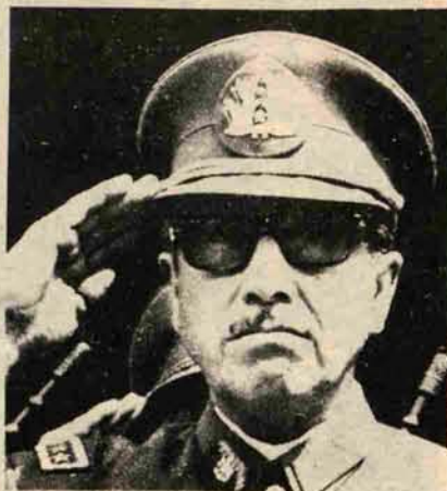
Above: Pinochet, leader of the junta. Right: military guard a prisoner

Brazilian police have been brought into Santiago to instruct their Chilean counterparts in the refinement of torture.