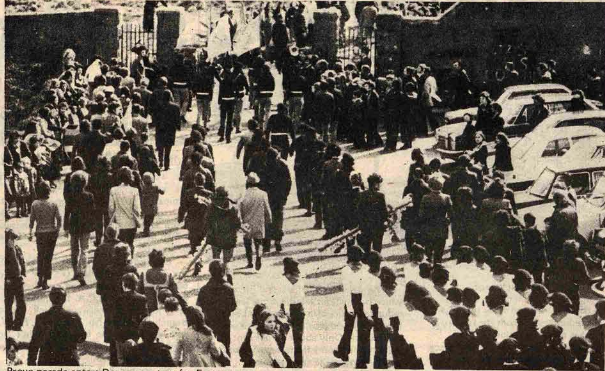
Provo parade enters Derry cemetery for Easter ceremony