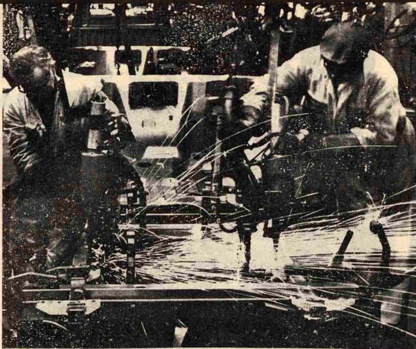
Motor assembly workers—their jobs are threatened

One industry with a permanent redundancy threat over the heads of the workers in it is the car assembly industry. Not so long ago there were dramatic headlines in the evening papers announcing how car workers had set up an action