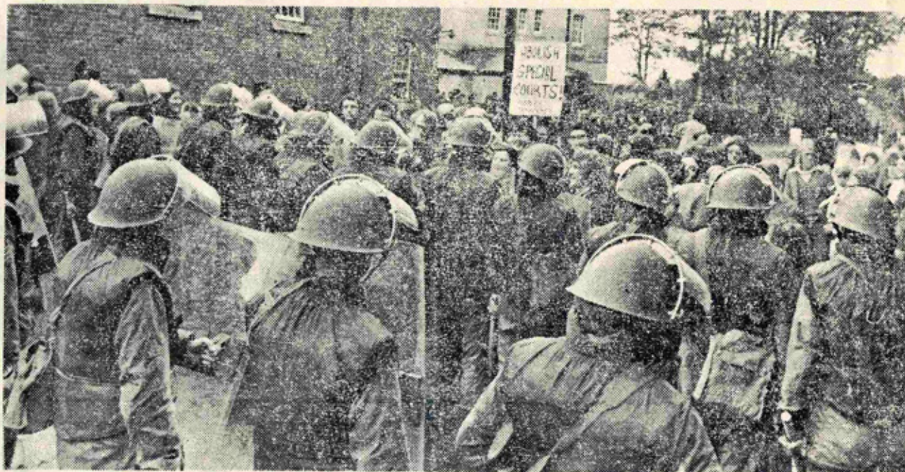
Irish Troops advance against Demonstration against Special Courts