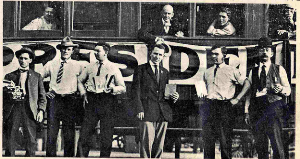
Eugene Debbs aboard his 'Red Express' Campaign Train in 1912

At the same time neither he, nor Wallace, nor Nixon can begin to solve the nightmarish problems which face American society. It is rotten from top to bottom. McGovern in power will tear away from the Democratic 'liberals' their last tawdry rags. If Nixon remains for another term he