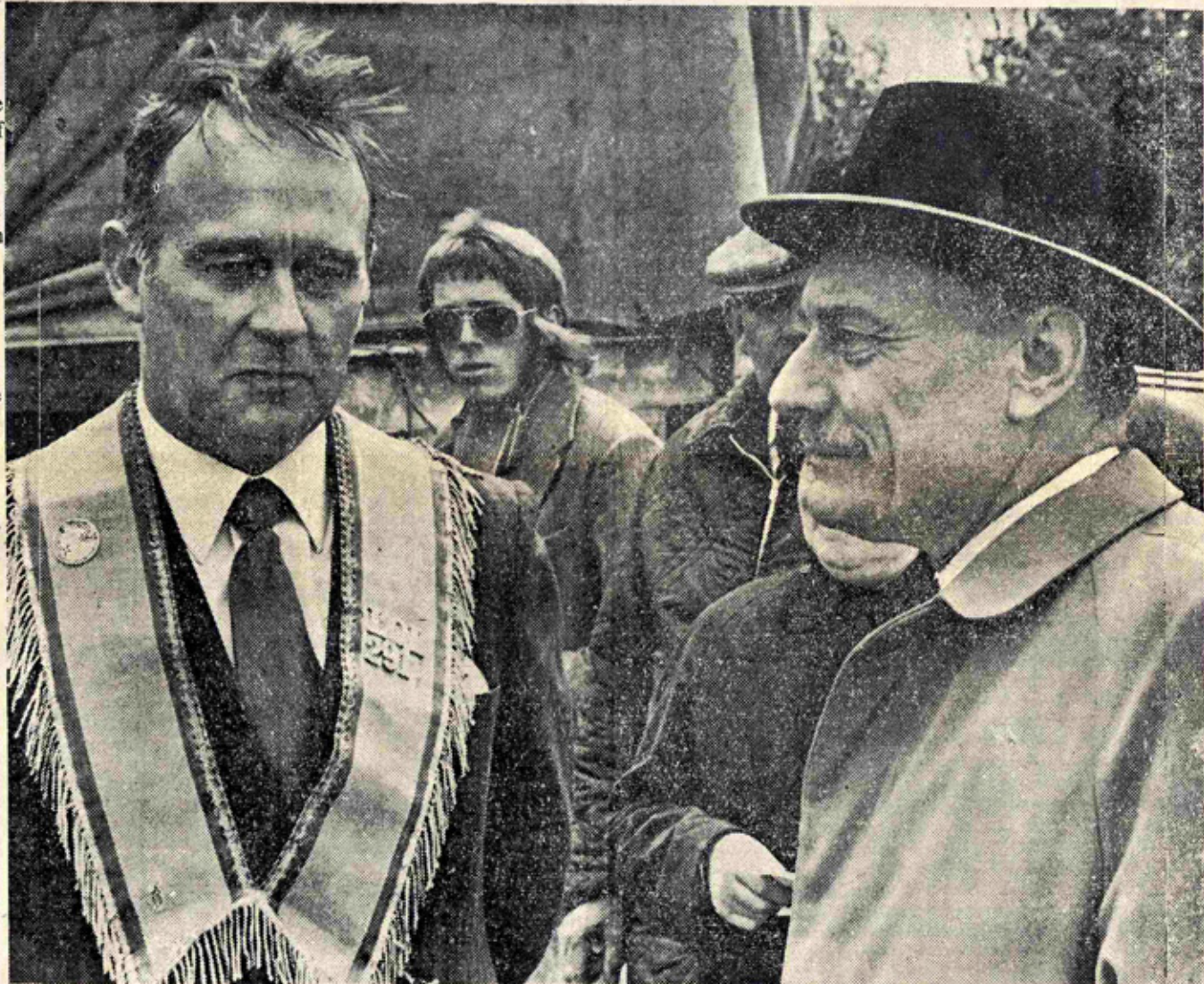
Craig and Powell - Enemies of British and Irish Workers

When a serious class lead is given, the NILP can make important gains. In a by-election for Coleraine council in 1971, the local Labour Party fought on a programme including such demands as a freeze on rents, cancellation of all housing debts and government provision of interest-free loans to local authorities. In the