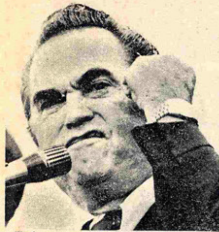
Workers support Racist Demagogue Wallace for want of an alternative.

George Wallace, the gathering in Alabama received in the De- the equally powerful ground- McGovern all indicate the under USA at present.