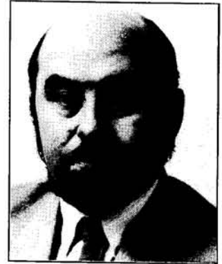
Ruairi Quinn, Deputy Leader of the Party discusses the tax and economic element of Labour's election campaign.

In conclusion, hindsight is a wonderful science. I was fully involved in the campaign preparations and so I am responsible for my own role. We do need, all of us, to look now at what happened and see what lessons are apparent now that we can apply for the future. After all, we could be facing an election sooner than we think!