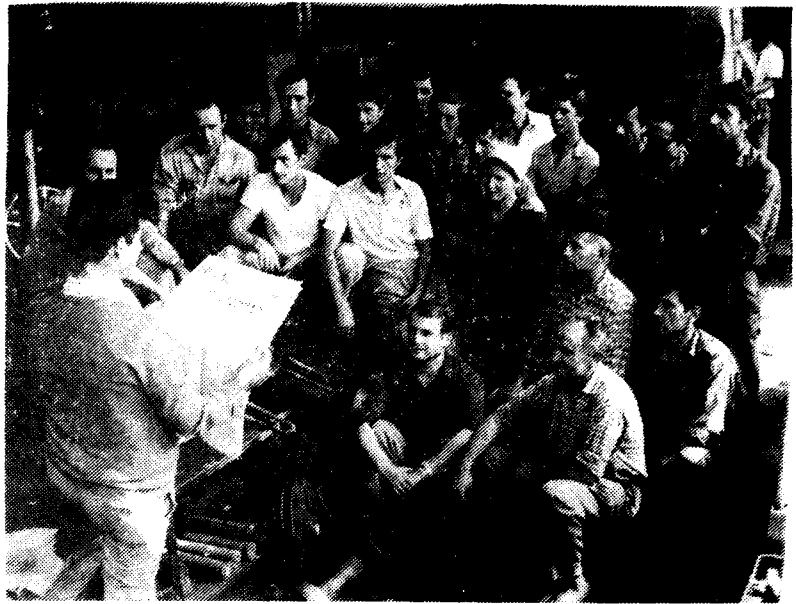
Workers in Albania studying 'Zeri i Popullit'- newspaper of the Party of Labour of Albania.

The pamphlet explains that : "In Albania the working class is in power. It has the political power in its hands and under the guidance of its Party of Labour, it sets the tone for the entire life of the country. This leading role is sanctioned in the Constit-