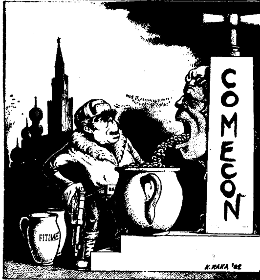
From 'Drita' -- PSRA.

Although the superpowers have a great economic and military potential and try to pose as if they are invincible, reality shows the opposite. The history of the latest decades provides numerous examples of the triumph of the peoples in their just