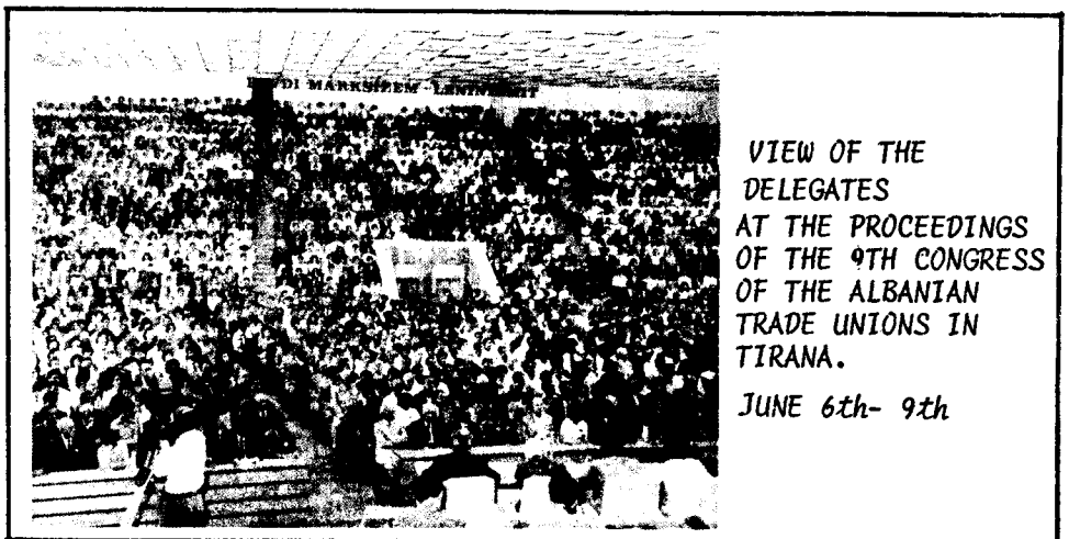
VIEW OF THE DELEGATES AT THE PROCEEDINGS OF THE 9TH CONGRESS OF THE ALBANIAN TRADE UNIONS IN TIRANA. JUNE 6th- 9th

The pamphlet begins by explaining the aims and objectives of the 9th Congress of the ATU; to analyse the great work done in the construction of socialism by the working class during the past five years, to sum up the experience gained in the communist education of the working class and to define the tasks for the next period. The pamphlet then goes on to explain the role of the trade unions in Socialist Albania: