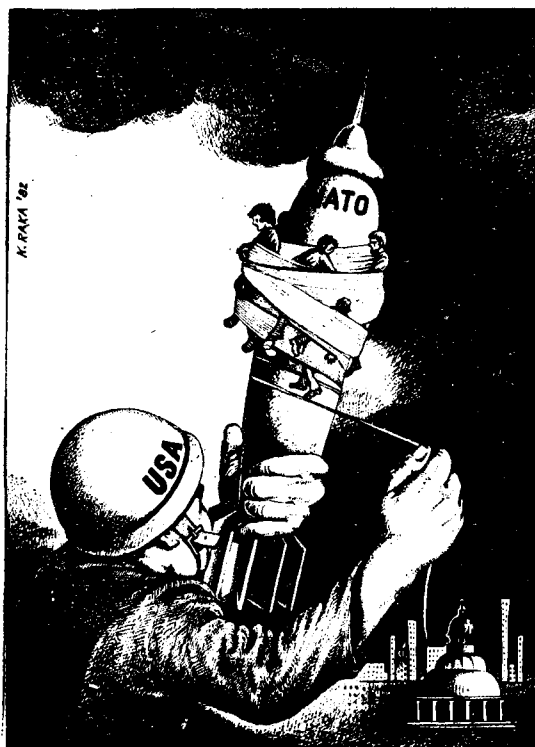
From 'Drita' - PSRA