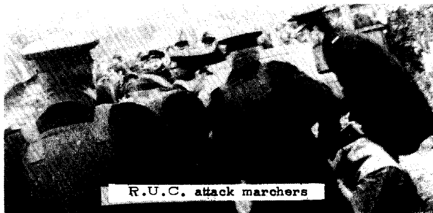
R.U.C. attack marchers