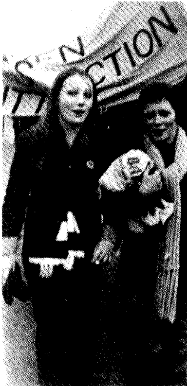
The Last Lap