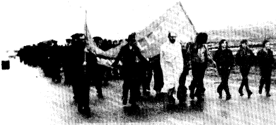
The marchers on the Glenshane Pass

The march was the clearest demonstration yet of the depth and breadth of feeling in the anti-Unionist population on the H Block issue. It gave the people of Co. Derry an opportunity to turn their passive sympathy with the prisoners into active support - an opportunity they seized with both hands. And by mobilising that support in the first days of the New Year it made very clear that 1979 will be the year of the H Blocks: that there will be more and more protests throughout the 32 counties until the British give in on political status.