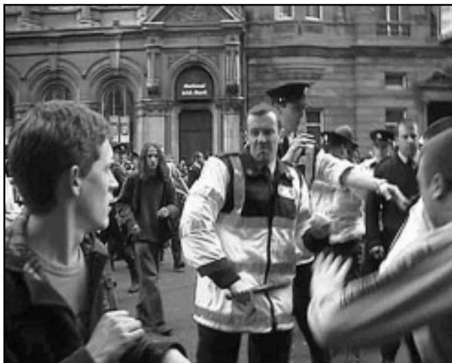
May 2002: Gardaí baton anti-capitalist protesters in Dublin

The entire judicial system and police force needs to be reformed and the rights of suspects guaranteed. Even the Taoiseach, Bertie Ahern, accepts that there is public concern about allegations of corruption. This year is the 80th anniversary of the establishment of An Garda Síochána. How will it be marked? If the Morris Tribunal is anything to go by, the state might be best advised not to mark the occasion at all.