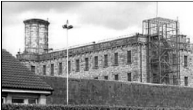
Portlaoise Gaol, Co. Laois

During the course of the inquiry it was brought to our attention that the RIRA leadership is currently fraternising with, and recruiting, known criminal elements. These factors clearly point to the organisation's continuing downward spiral. However, the RIRA leadership, as an option of last resort, may attempt to merge with the CIRA. Indeed, there are indications that tentative moves in this direction are already being made. A handful of RIRA prisoners now share a landing with the CIRA in Portlaoise prison. And both organisations recently held a joint commemoration within the prison.