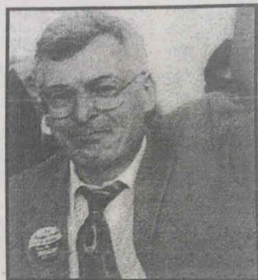
Joe Higgins TD.

The demonstration is being organised by the Socialist Party and is being supported by the trade unions, ATGWU and Mandate, and is also supported by USI (Union of Students in Ireland).