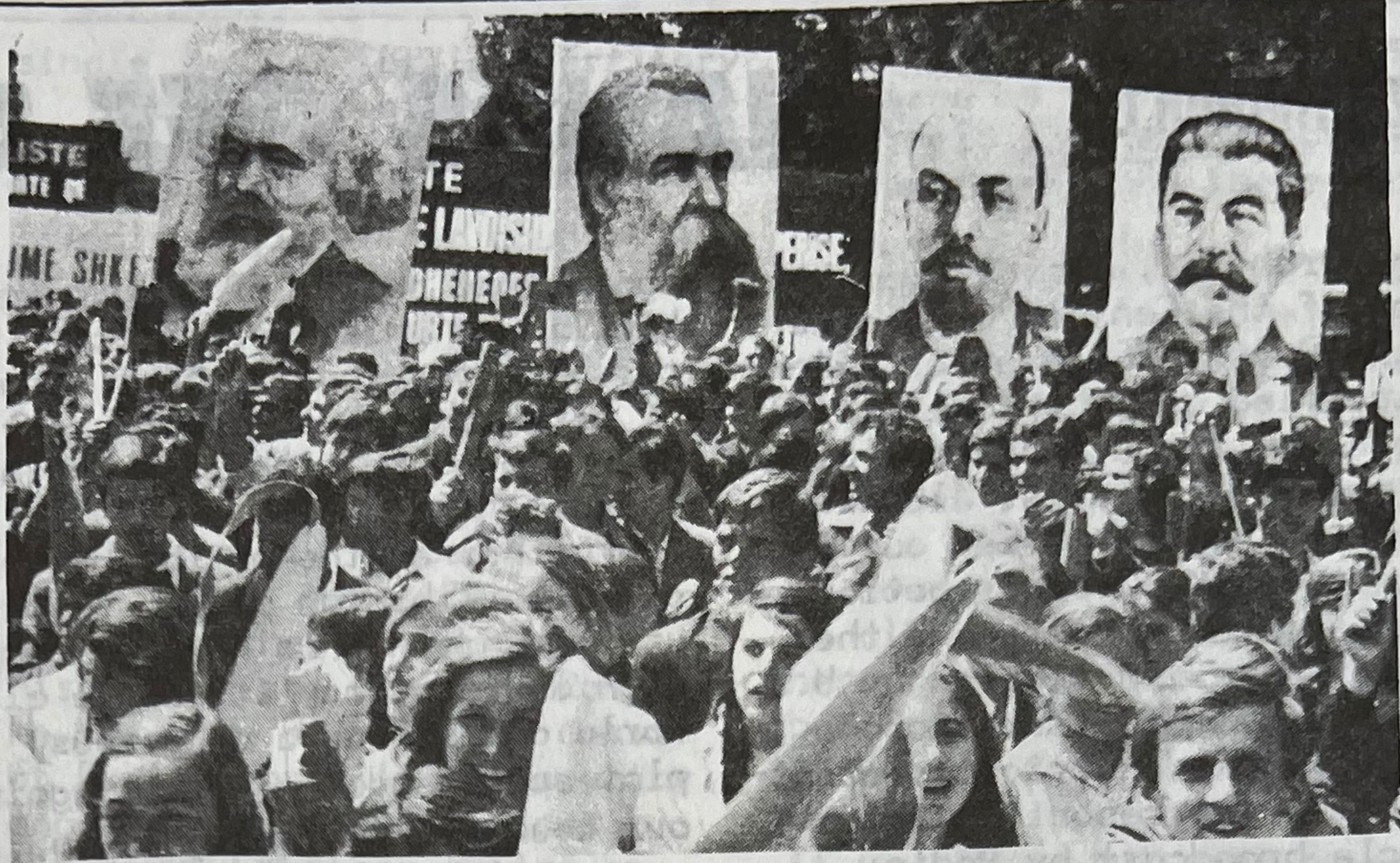
MAY DAY IN PEOPLE'S SOCIALIST REPUBLIC OF ALBANIA

It is in this context that the watchword of James Connolly, the great patriotic martyr and militant organiser of the Irish working class, must be our watch-