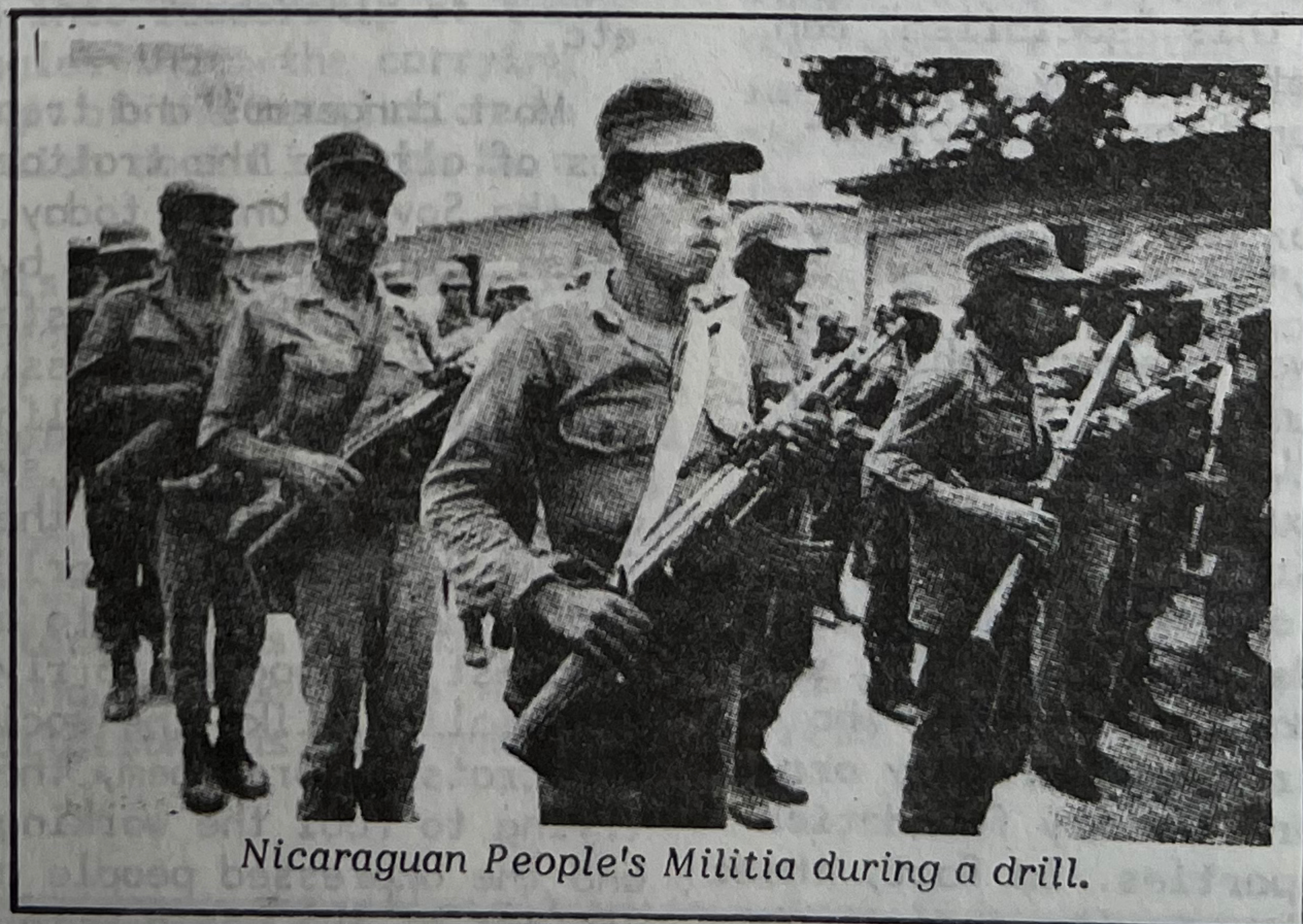
Nicaraguan People's Militia during a drill.